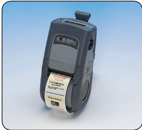
QL 220 Plus™

Take 2-inch label, ticket, and receipt printing where stationary and larger mobile printers dare not go—whether it's down store aisles, on hospital rounds, or onto retail pharmacy counters. Strap or clip on the sleek, 1.04-pound QL 220 Plus network-addressable label/receipt mobile printer and move with ease!