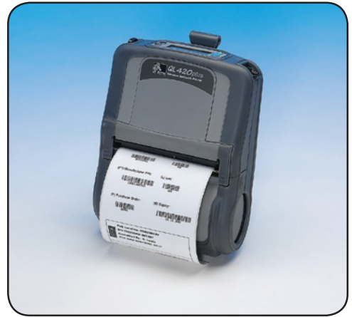
QL 420 Plus™

Bring the flexibility of wireless printing to your 4-inch label or receipt applications with Zebra's QL 420 Plus mobile printer. Built to survive the rigors of warehousing, distribution, and route accounting, the QL 420 Plus offers a mobile mount option to allow printing in a forklift or vehicle.