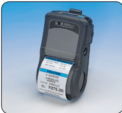
QL 320 Plus™

Zebra's popular QL 320 Plus mobile printer, for print widths up to 3 inches, was the first to offer the flexibility of 802.11b/g radio modules to meet evolving needs and wireless standards. Count on its durable design to endure tough manufacturing or shipping/receiving environments.